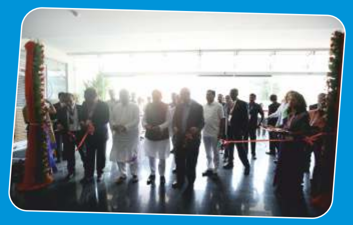
Official inauguration of Hall 5