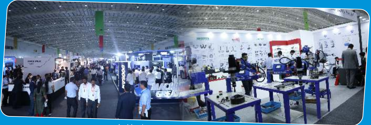
Inside view of the halls during the exhibition