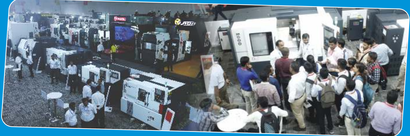
Live machines on display