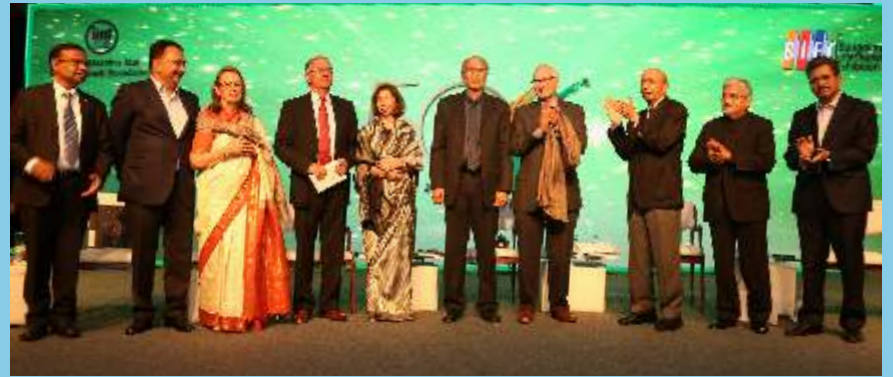
Felicitation of Godrej Family Members