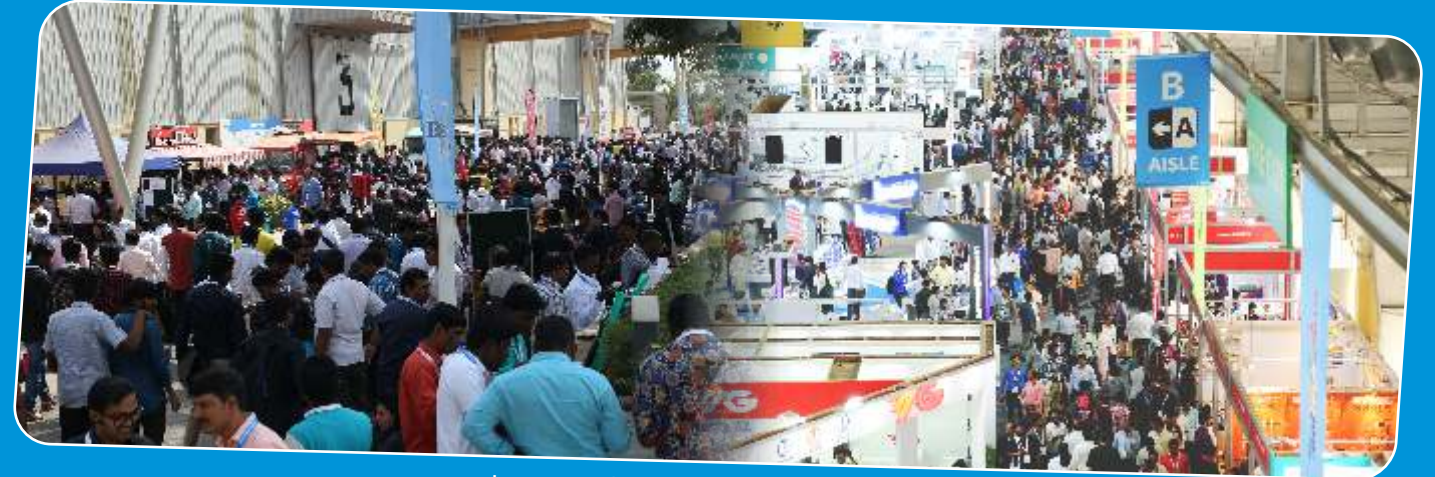
Large number of visitors at IMTEX 2019