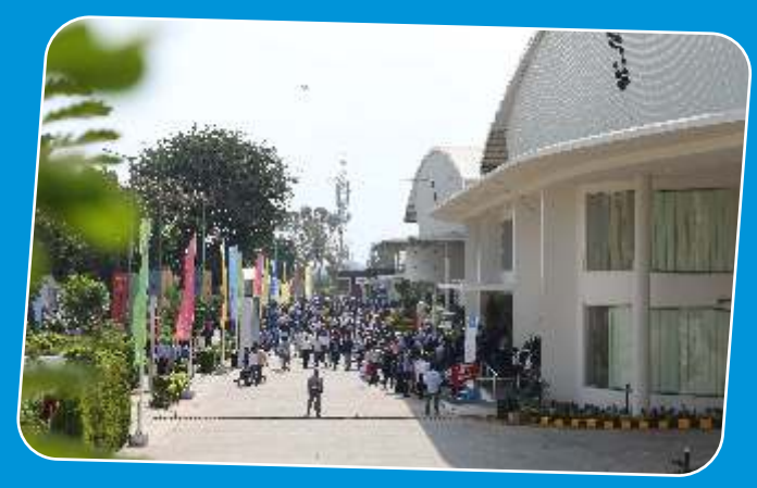
With a newly constructed Fifth Hall, IMTMA was able to offer more space for exhibitors