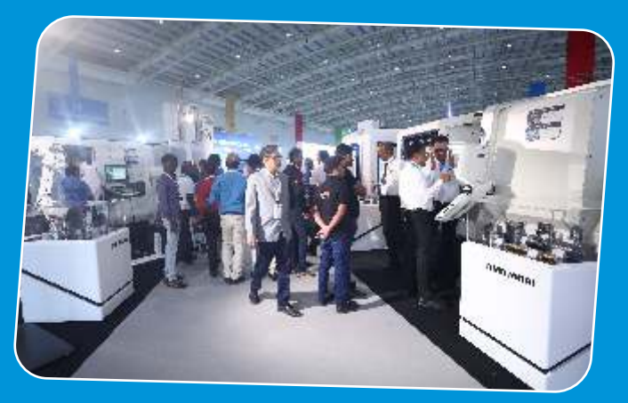
Visitors engaged in business