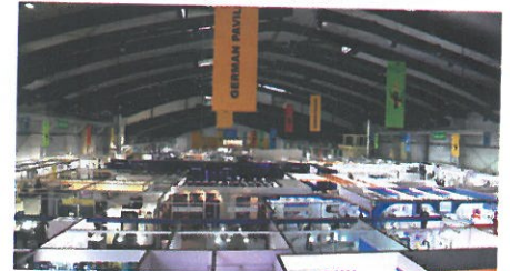
Overview of the German Pavilion at IMTEX 2017 and Tooltech 2017

for the states of Hessen, Baden-Württemberg and Bayern, of which Baden-Württemberg had the biggest one.