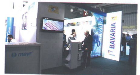
Pavilion for the State of Bavaria, at IMTEX 2017 and Tooltech 2017