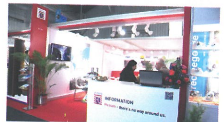
Hessen state pavilion at IMTEX 2017 and Tooltech 2017

IMTEX 2017 and Tooltech 2017 was also attended by a high profile German delegation of over 100 members, from Baden-Württemberg, led by Winfried Kretschmann, Minister President of the State of Baden-Württemberg.