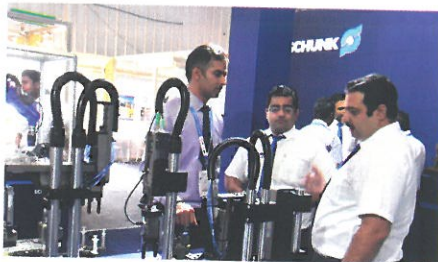
Technology on display at IMTEX 2017 and Tooltech 2017

Innovation was the order of the day with hybrid machines, 3D printing, Industrie 4.0, and other high-end technologies being up for display and demonstration to give visitors a glimpse into what a futuristic outlook to machine tools entails.