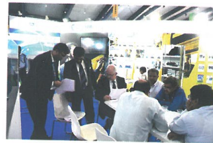
Knowledge and information exchange at IMTEX 2017 and Tooltech 2017

Business owners, key decision makers, policymakers, and government stakeholders were well-represented at the event, making it a valuable networking and interaction platform, and ensuring that IMTEX 2017 and Tooltech 2017 was a huge success.