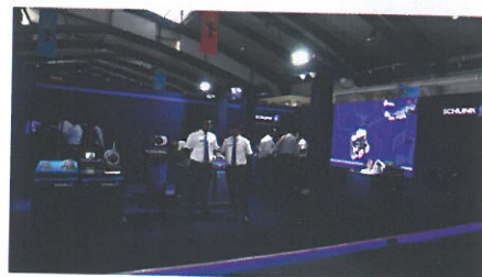
Glimpses of some exhibitors at IMTEX 2017 and Tooltech 2017

The Indo-German Chamber of Commerce (IGCC) organized the German Pavilion, supported by German Machine Tool Builders' Association (VDW), at IMTEX 2017 and Tooltech 2017. It was one of the biggest country pavilions, with three state pavilions as part of it. Covering an area of over 3000 sqm., the German Pavilion also hosted the pavilions